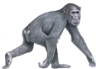
Central chimpanzee ( Pan troglodytes troglodytes )

With 140 members, including some of the world's most distinguished and experienced great ape researchers, the combined expertise of the SGA spans the scientific, social and ethical aspects of great ape conservation, providing a comprehensive perspective on the challenges and solutions available.