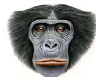
Bonobo ( Pan paniscus )