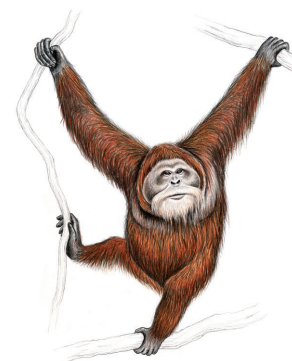
Sumatran Orangutan ( Pongo abelii )

The IUCN SSC Ape Populations, Environments and Surveys (A.P.E.S.) database is a joint initiative of the Max Planck Institute for Evolutionary Anthropology and the SGA. A.P.E.S. is a repository for survey data on great apes; a place to store information for monitoring populations and distributions that allows for the analysis of population trends and for well-informed priority-setting, hypothesis testing, and policy advice. The database is the foundation of the A.P.E.S. Portal, where information on species status, data availability and survey data gaps, geographic range, occurrence probability, threat and trends in occurrence is available and will be regularly updated. See: http://apesportal.eva.mpg.de