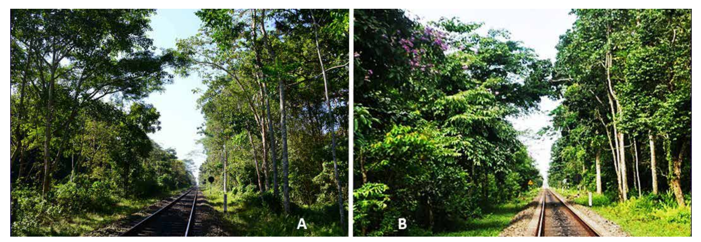
Figure 4. The Natural Canopy Bridge finally connects forest Compartments I and II in the Hoolock Gibbon Wildlife Sanctuary in 2019 (image A, photograph by R. C. Kyes, December 2019) and continuing to grow (image B, photograph by D. Chetry, April 2021).