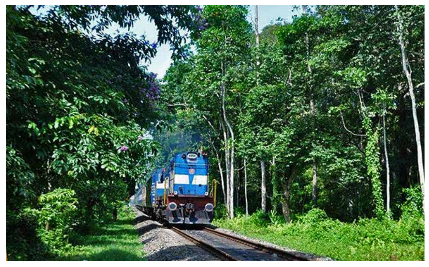
Figure 5. Train passing under the Natural Canopy Bridge in the Hoolock Gibbon Wildlife Sanctuary. Photograph by D. Chetry, April 2021).

et al. 2016). The architecture and building materials of ACBs vary for different animals (for example, Goosem et al. 2005; Lokschin et al. 2007; Goldingay et al. 2013; Teixeira et al. 2013). Some of the most common building materials for ACBs include wooden poles (Valladares-Padua et al. 1995; Garcia et al. 2022), plastic coated steel cables (Weston et al. 2011; Thurber et al. 2016), and single rope or bamboo (Das et al. 2009; Lindshield, 2016; Narváez Rivera et al. 2016; Garcia et al. 2022). Das et al. (2005,