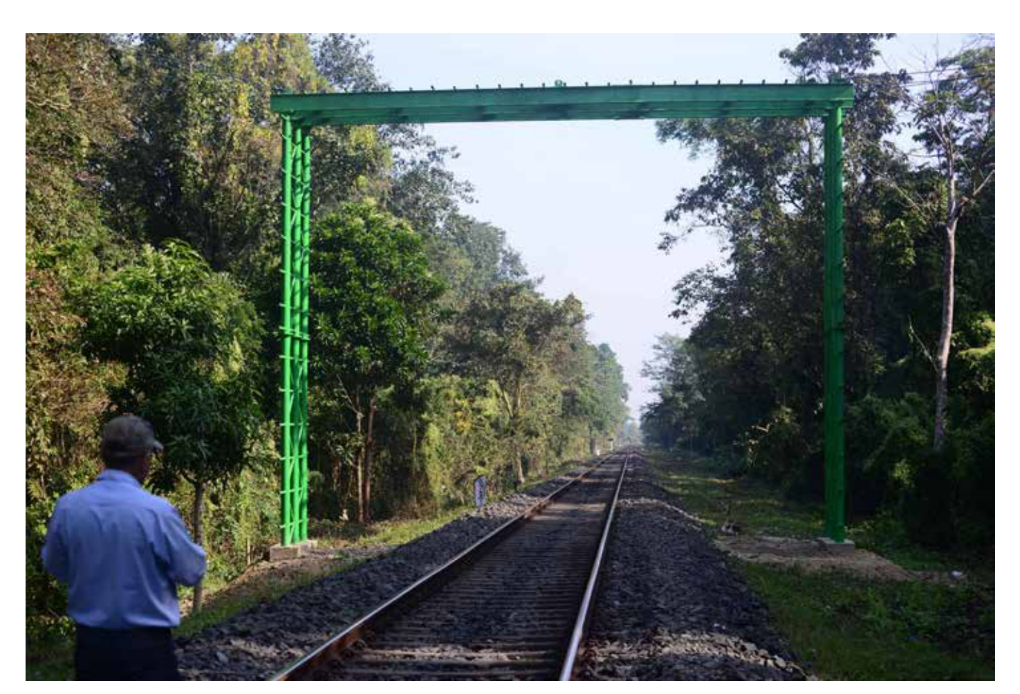
Figure 6. Artificial Canopy Bridge constructed by the railway company in the Hoolock Gibbon Wildlife Sanctuary in 2015. This photograph is looking east, back toward the location of the growing Natural Canopy Bridge. Note that the trees have not yet created the bridge across the tracks. Photograph by R.C. Kyes, November 2015).

Table 1. Observations of gibbons and other primate crossing the Natural Canopy Bridge.