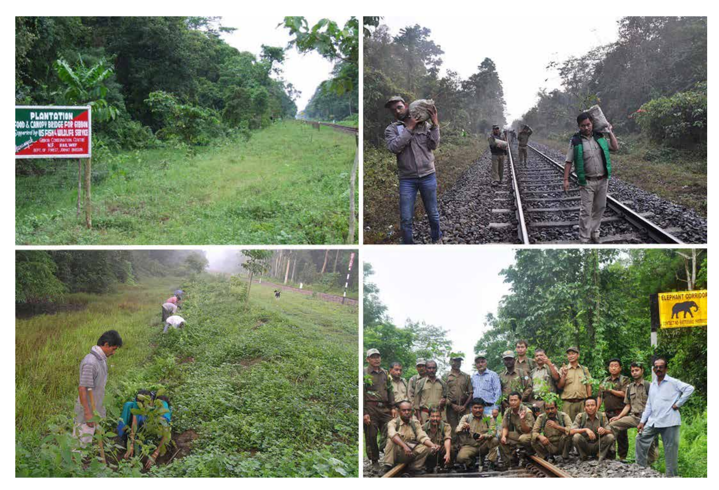
Figure 2. "Plantation Programme: Food & Canopy Bridge for Gibbons" in the Hoolock Gibbon Wildlife Sanctuary during 2006. Planting of the trees along the railway track was conducted with the assistance of the local community and the Hoolock Gibbon Conservation Training Trainees. Photographs by D. Chetry, April, 2006.

Although of course enhancing human mobility and communication, roads and railways have been identified as a potential threat for numerous primates in many areas