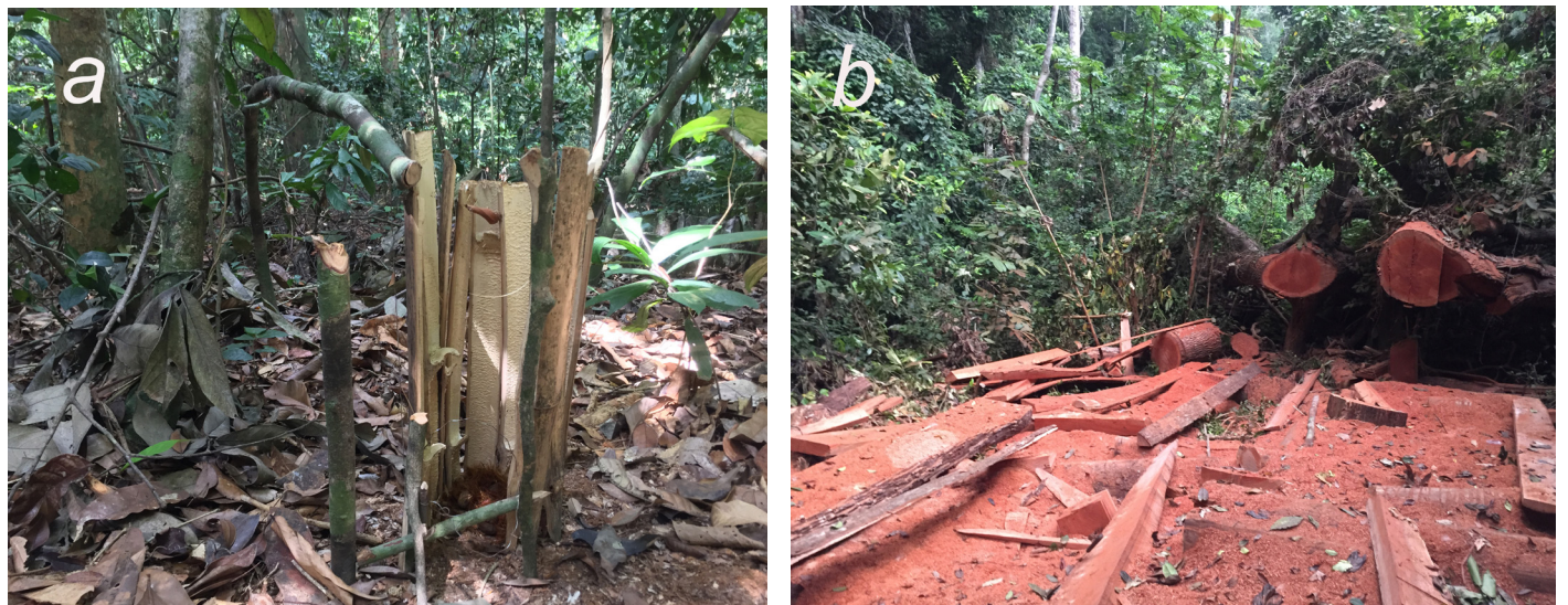
Figure 3. Images of illegal anthropogenic activity observed in Cape Three Points Forest Reserve, Ghana, during this study; (a) a hunting snare and (b) an active logging site.

through the canopy (Bowler et al. 2007). Once set up, camera traps were left undisturbed for 20 days, with the exception of four locations in the central area where some cameras had to be reset once due to malfunctions (Table 1). Camera traps (Bushnell Trophy Cam HD, #119677) were programmed to take bursts of three pictures, with an interval of 60 seconds between bursts, once triggered by any movement within their detection range. Captures of species were considered independent events when a minimum of 30 minutes had elapsed between three-photograph bursts.