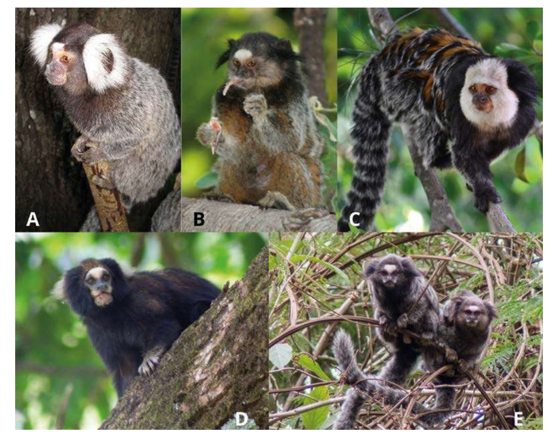
Figure 1. Examples of pelage patterns in Callithrix genus. (A) Callithrix jacchus . (B) Callithrix penicillata . (C) Callithrix geoffroyi . (D) Callithrix aurita and (E) hybrid individuals.

In the hybridization process, hybrid individuals are expected to show a wider phenotypic variation than the parental populations, that can result in a mix of phenotypic patterns of each parent, making it possible to distinguish the hybrid's parental species in the first generations (Fuzessy et al. 2014) but as the hybrid forms reproduce, those patterns fade away, creating a marmoset with a grey-ish-pattern pelage, a mix of many generations of hybrids and the parental species could be just inferred (Fig. 1E).