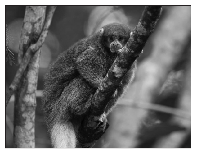
Figure 7. C. donacophilus North of Santa Cruz de La Sierra (#33), Daniel Alarcón.

The Chaco riverine, hydrophytic, and seasonally flooded forests along the Parapetí river (# 11-18) harbor abundant C. pallescens and three other primate species (Ayala and Noss, 2000; Ayala, 2011) despite their upper - semi-arid ombrotype (475-625 mm of rainfall). The influence of the river and a shallow water table allow the existence of dense 'algarrobo' ( Prosopis chilensis ; Fabaceae) forests, where titi monkeys were found at densities of 3.5, 6.2 and