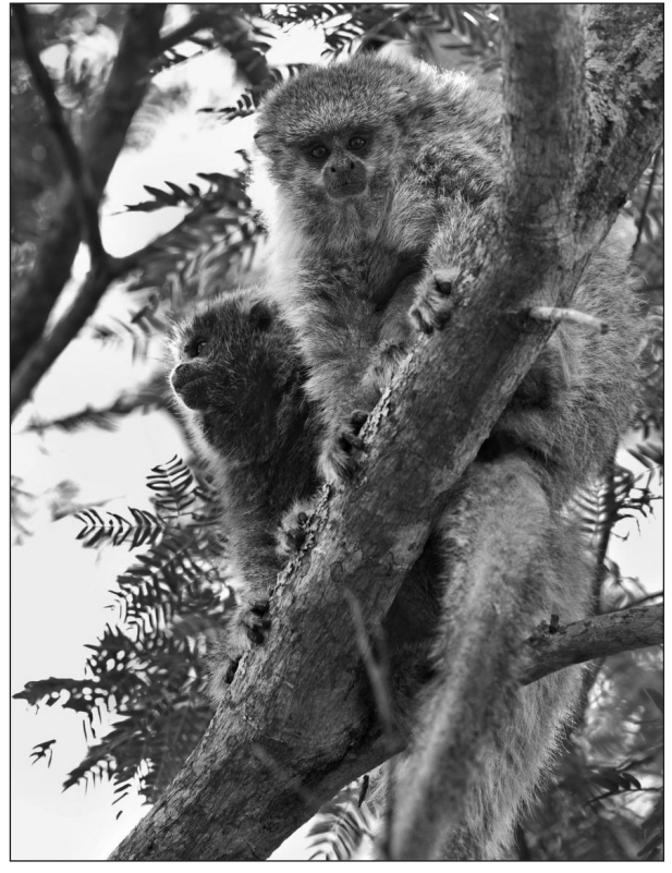
Figure 4. C. pallescens in #7, Daniel Alarcón.

Pantanal (Smith, 2012). According to all our photos, the color pattern of C. pallescens individuals agreed with the published descriptions of the species, although their faces were not as white as in the drawing from van Roosmalen et al. (2002).