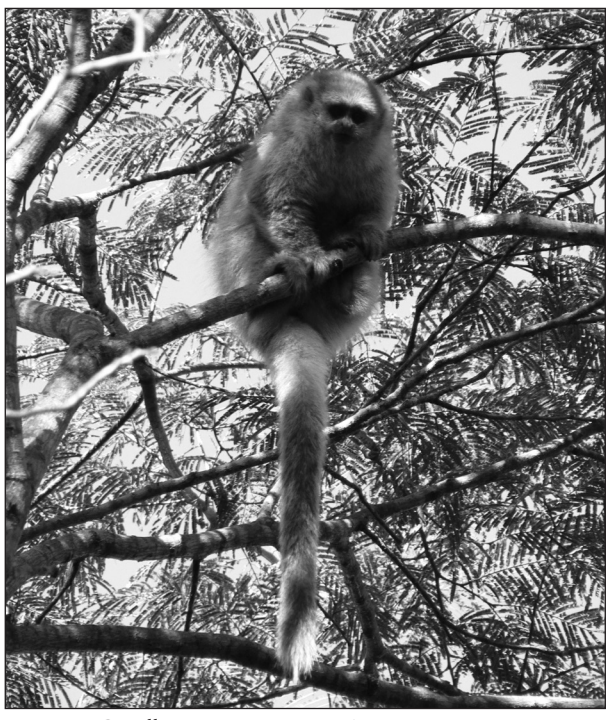
Figure 3. C. pallescens in #8, Rosario Arispe.