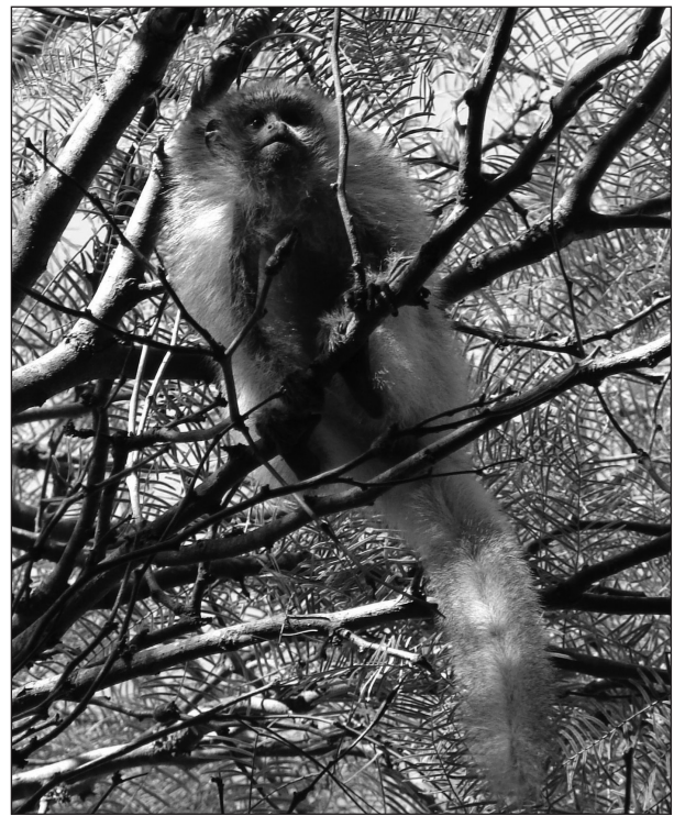
Figure 5. C. pallescens, Río Parapeti #13, Luis Acosta