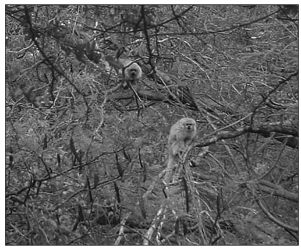
Figure 2. C. pallescens at Ravelo (#1), Martin Thurley.

camp Tucavaca and nearby points (#6, 7, 8), and community sites along the Parapetí river (#13 through 19). From Ravelo and Palmar there are photos and a video that show the long and uniformly colored pale buff pelage of the individuals (Fig. 2), as well as in Sol de Mayo (Fig. 3) and Tucavaca (Fig. 4). The photograph from Paraboca in the Parapetí river (Fig. 5) shows the same light color of the individuals sighted in nearby riparian communities, including the locality # 15 where three specimens were collected in the 1980's and assigned then to C. donacophilus pallescens by Anderson (1997). Sightings and a photo from the Rio Negro in the Otuquis Pantanal (#24, Verónica Zambrana, pers. comm.) also matched C. pallescens descriptions, as well as the photos available from the nearby Paraguayan