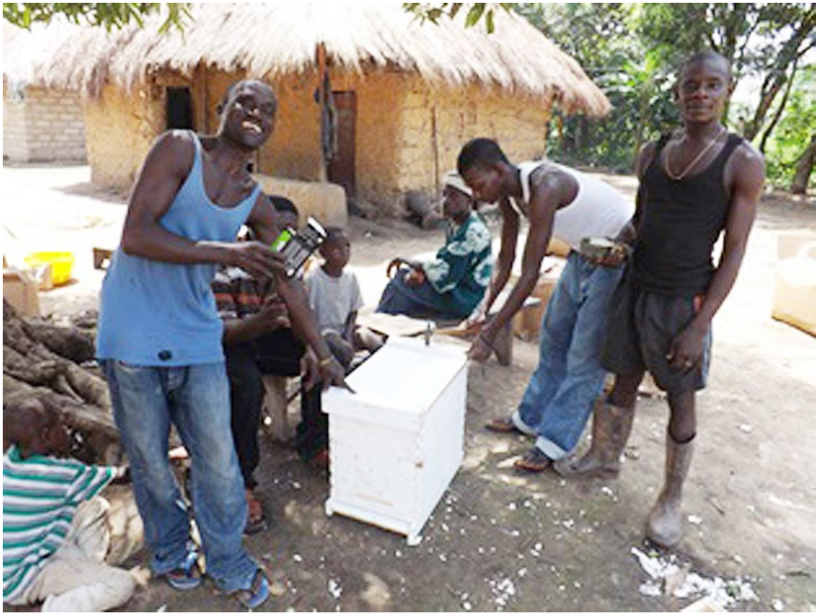
Figure 3. Newly constructed bee-keeping box at the Tonkolili Site.

was done as part of a course in “Science Serving Humanity” and provided a hands-on educational opportunity for the students. Likewise, Lynn University donated all manufacturing supplies and the shipment costs to the project. Currently, hive boxes, starter wax, protective outfits, supplementary supplies and 10 bee-keeping boxes are in Marocki and Manoni. For each village, the boxes are expected to yield an average of 150 kg of honey per semiannual harvest.