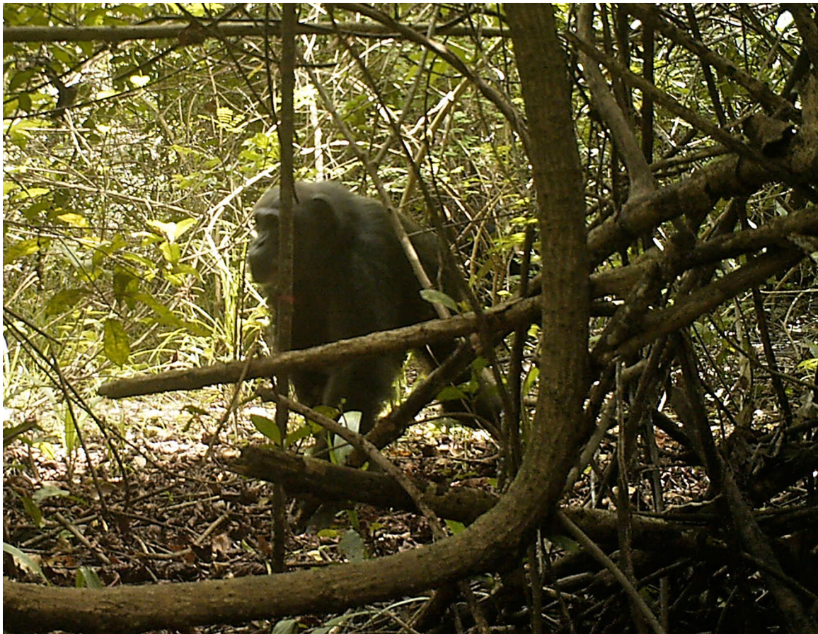
Figure 1. A chimpanzee at the Tonkolili Site.

interactions lead to a situation where chimpanzees are killed in anthropogenic landscapes, stemming predominantly from either real or perceived resource competition in a heavily fragmented landscape.