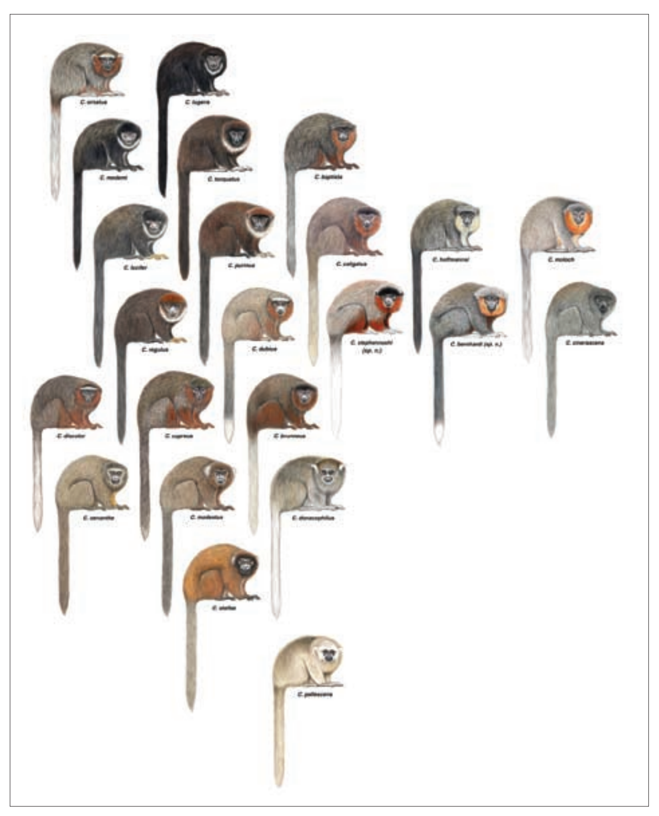
Figure 3. The Amazonian taxa of titi monkeys, genus Callicebus, more or less geographically arranged. Illustration by Stephen D. Nash.