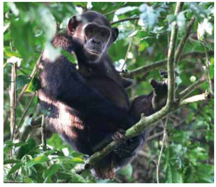
A subadult female chimpanzee (Pan troglodytes troglodytes), Republic of Congo.

It is also important to recognize that gorillas and chimpanzees are likely to be affected differently by timber extraction and