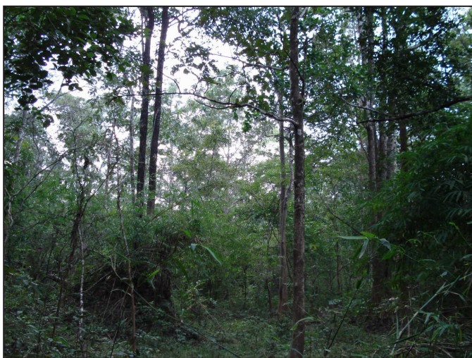
Figure 3. Habitat typical of T. germaini : level lowland forest with open canopy. Ban Vangsikeo, Dong Phou Vieng National Protected Area; 6 November 2007.

All Indochinese silvered leaf monkey records in Lao PDR with precise habitat information (given in the Appendix) were from forms of semi-evergreen forest or its degraded derivatives, in areas with uneven canopy (Fig. 3). Occupied areas were typically as patches and strips within a mosaic of more deciduous forest types, especially in riparian and other waterside situations. Where noted, occupied semi-evergreen forest was generally at the dry end of its spectrum, with a high deciduous tree component (as is the predominant form in plains-level locations in inland Indochina). Such forest grades into what some botanists consider a separate formation, mixed deciduous forest. In Cambodia many records come from habitat best described as mixed deciduous forest, but at the least deciduous end of its spectrum, and usually in association with wetland/riparian situations (RJT). Few if any records come