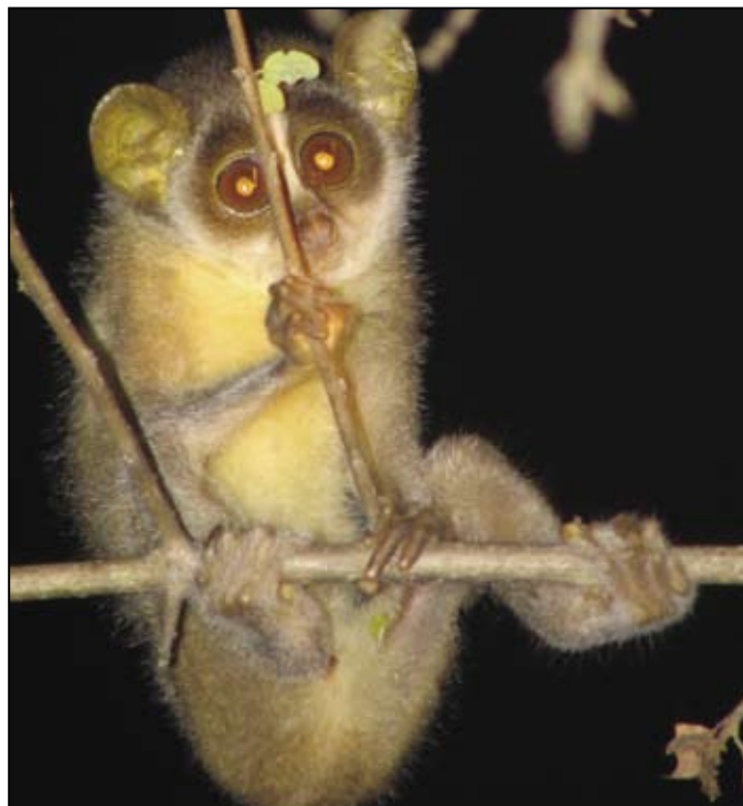
Figure 3. A young Loris lydekkerianus nordicus from Wilpattu National Park, Sri Lanka.

of collection unknown), from Monaragala and Badalkumbura (Jenkins 1987). During early surveys, Phillips recorded the strange, shrill cry of a loris without a confirmed sighting in Marai villu of Wilpattu National Park (Phillips 1933).