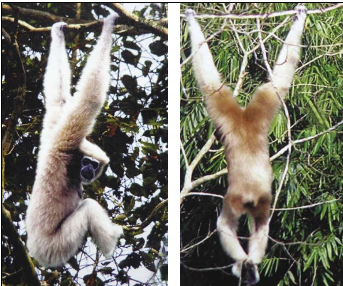
Figure 3. Adult female eastern hoolock gibbon ( Hoolock leuconedys ).