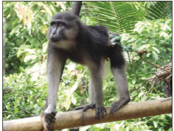
Figure 2. Pet juvenile male booted macaque ( Macaca ochreata ) in the village of Non Blok, South Sulawesi. Note the white/grey forearms and hindlimbs.

The estimates of group density of M. ochreata (range 0.97–2.0 per km 2 ) obtained in our study are lower than those found for other species of Sulawesi macaques: M. tonkeana