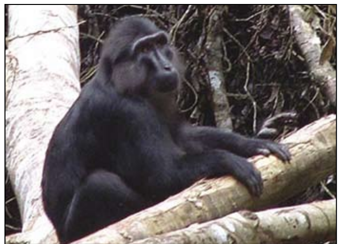
Figure 3. Adult male Tonkean macaque ( Macaca tonkeana ) from Lore Lindu National Park, Central Sulawesi. Note the all black body, including limbs and trunk.